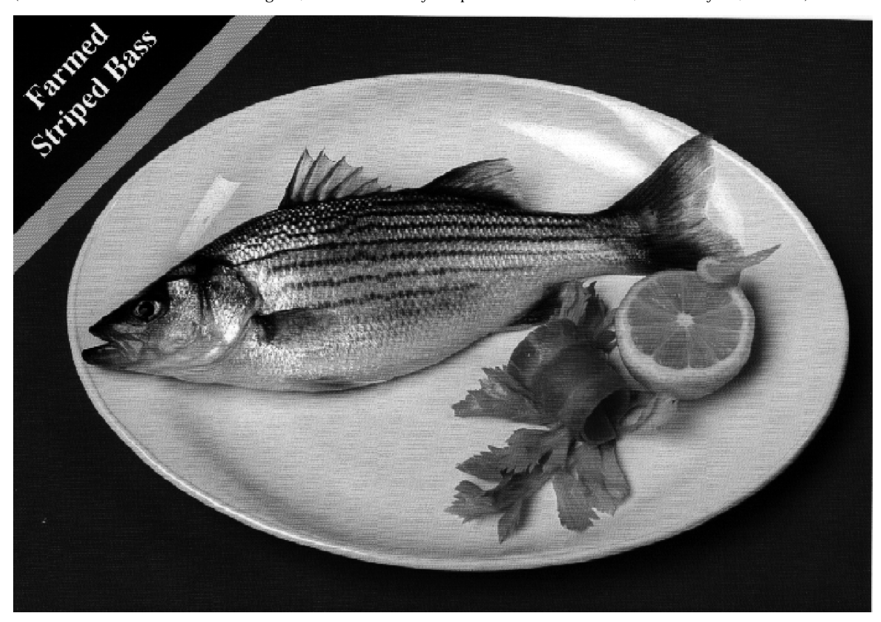
Figure 1. Point-of-purchase promotion, like the recipe card shown below, often enhances sales.